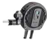
Smart Detection Camera Flir TrafiOne or equivalent